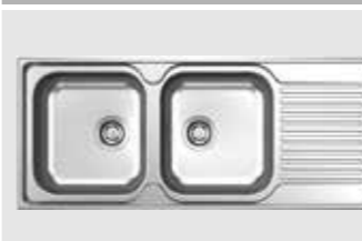
Clark stainless steel sink