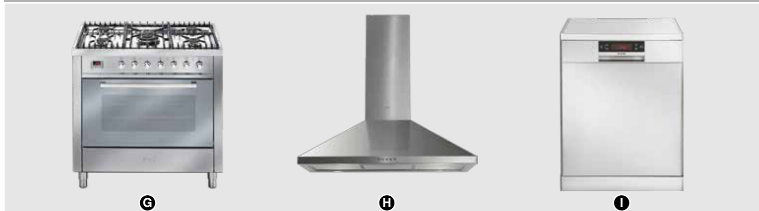
ILVE stainless steel freestanding oven (900mm), canopy rangehood (900mm) and dishwasher (600mm)