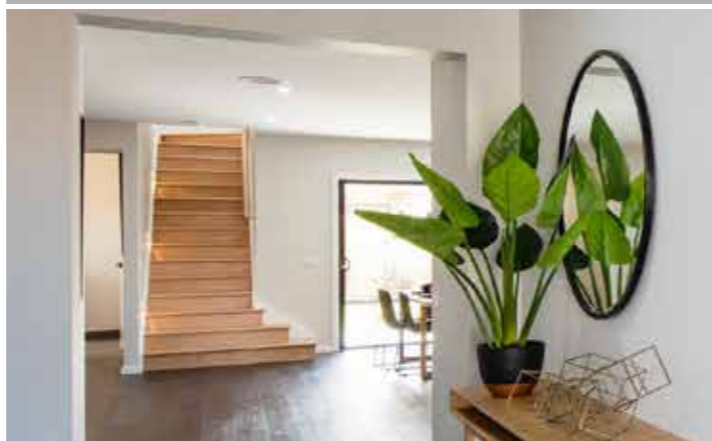
Vic Ash Hardwood staircase with hardwood handrail