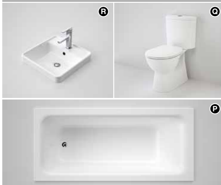
Caroma vanity basins, bath & toilet suites