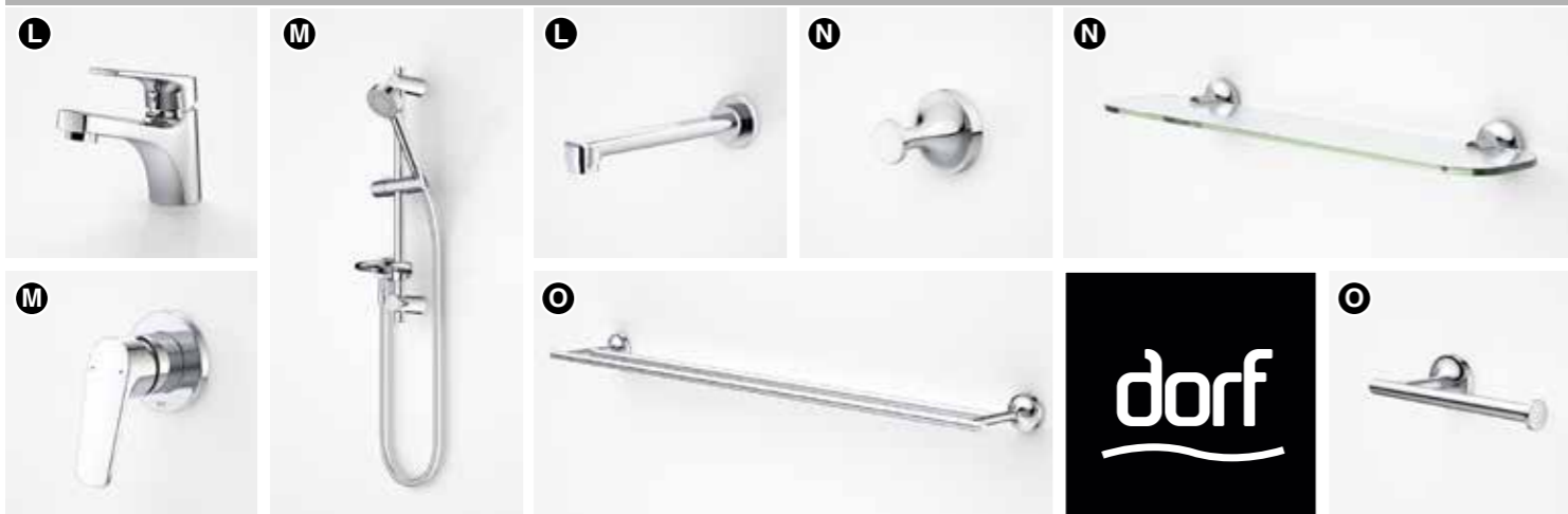
Dorf tap mixers, outlets and accessories